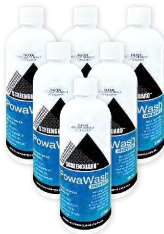
200ml per bottle