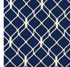
Grille Design 122

Normal insect screens are designed to keep out flies and mozzies, but they're simply not strong enough to withstand the day to day damage that domestic pets or children can cause. Microtech™ is highly durable aluminium, and therefore is an ideal and cost effective flyscreen for your family.