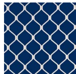
Grille Design 127