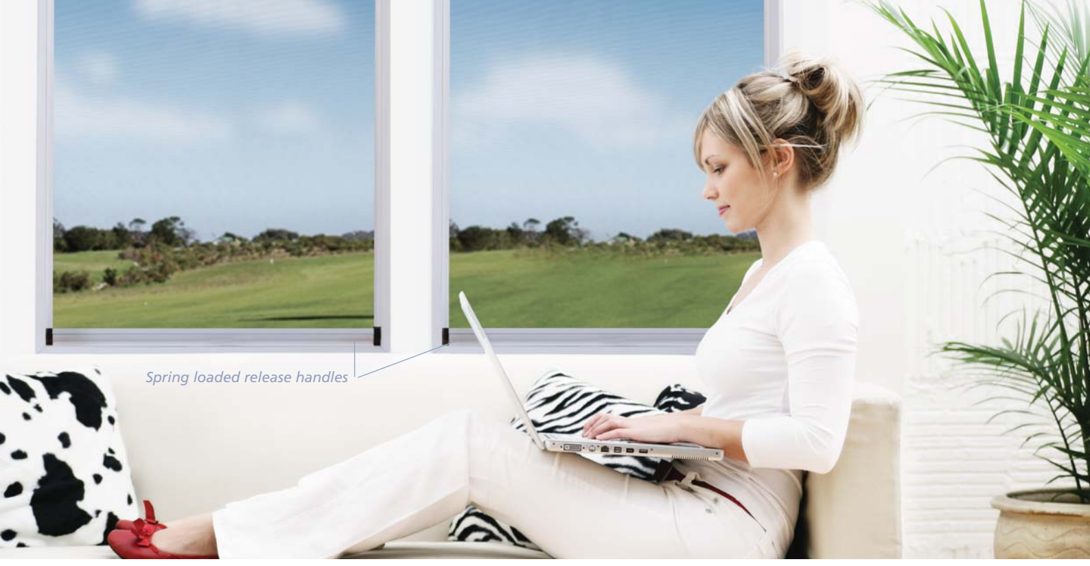
Spring loaded release handles