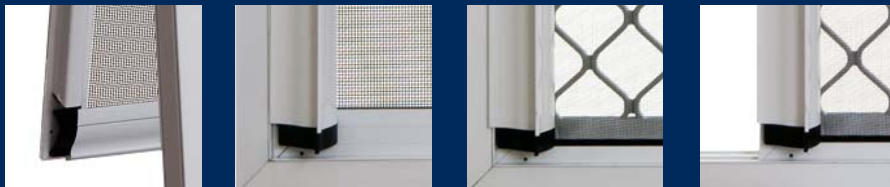
Spring loaded release handle allowing rapid operation in urgent situations