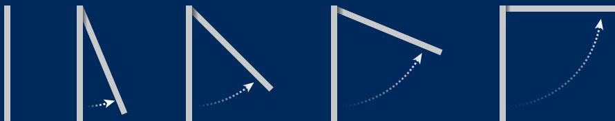
The SupaScape fire escape system has an outward opening functionality. Top Hung option shown.

The slim-line keyless design is available in stainless steel mesh and aluminium grille and also has a simplistic but effective child safety opening release that avoids accidental disengaging. All SupaScape systems are designed allowing you to gain access to the glass for easy cleaning.