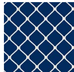
Grille Design 125