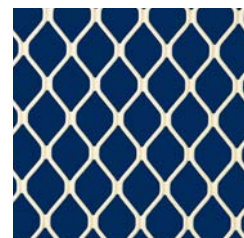
Grille Design 133